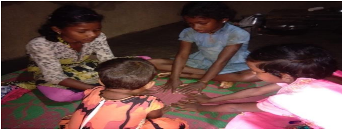
Playing with Children