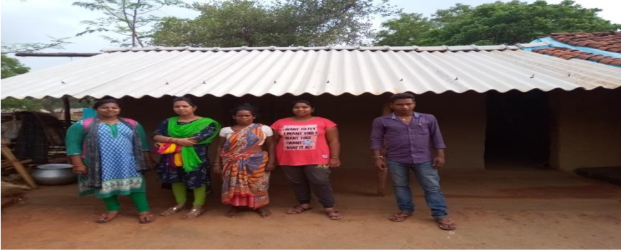
The new house self made with 20,000/ INR

VCPC during the monthly meeting called the PRIs and suggested in Pallisabha to provide her a house under Pradhan Mantri Abash Yojana (PMAY) scheme. Her name was approved. But not getting the assistance till date.