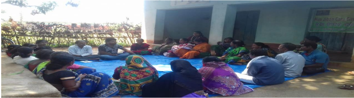
The VCPC Meeting for Finalisation of Sponsorship