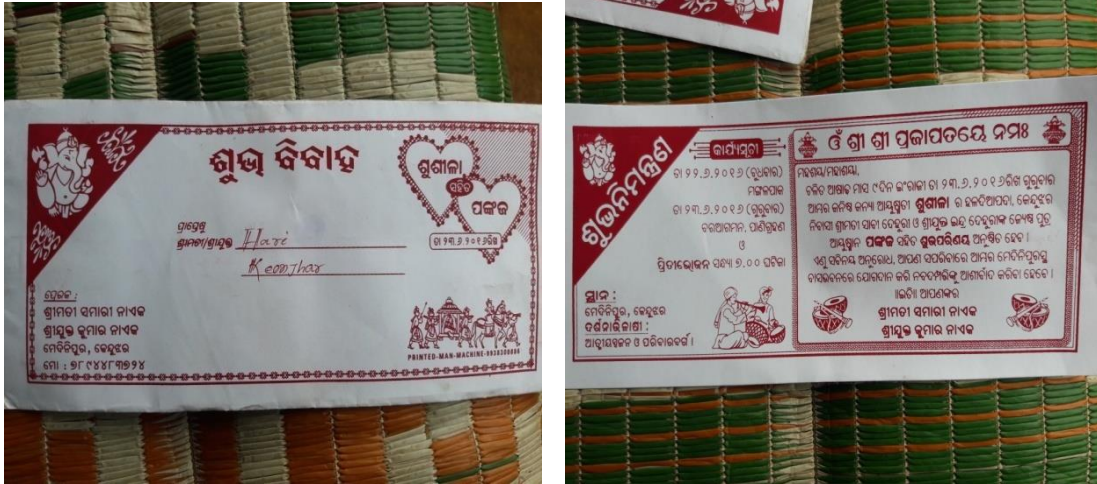
Marriage Invitation Card.